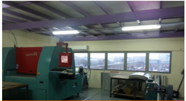
Inside of the workshop