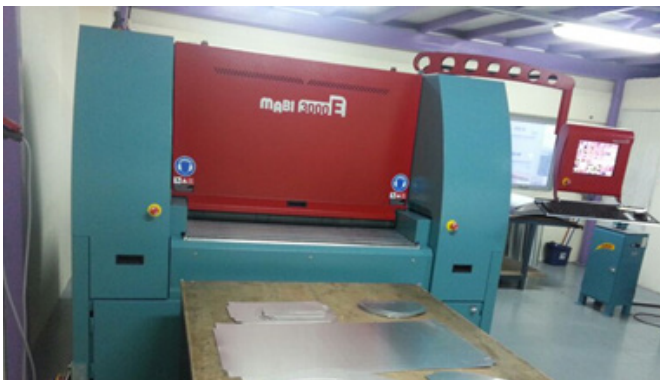
Side view of the MABI 3000E

Allows Loonglobal to offer outstanding savings and convenience to our customers in terms of mobilization, control and cost concurrently.