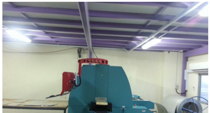
Front view of the MABI 3000E