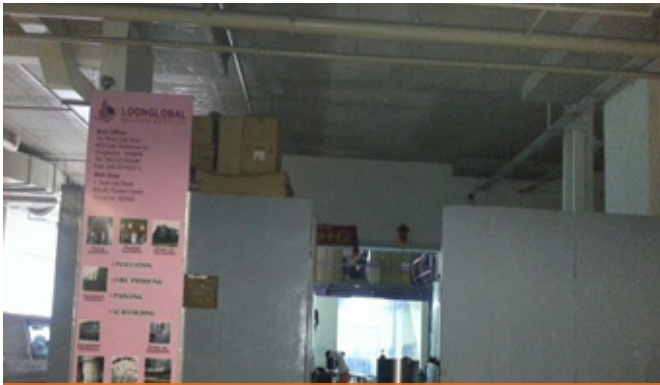
Loonglobal Fabrication workshop